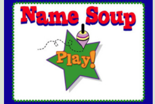
Storyteller instructional activities

Fundamentals of Galileo®: Curriculum Manual Fundamentals of Galileo®: Developmental Assessment Manual Fundamentals of Galileo®: Reports Manual